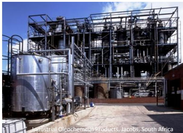
Industrial Oleochemical Products, Jacobs, South Africa

OleoCote L150-70W, L25-65W, L300-70W, L50-60W, M100-50W, M700-50W